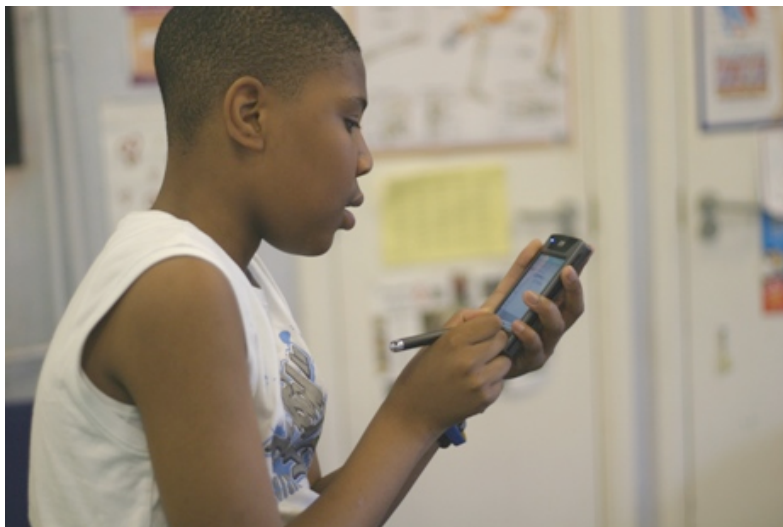
'Young person uses on of the hand devices'

Young people learnt about digital CCTV technology and debated the issues around privacy and public safety. With the help of an artist and a film maker and using a camera mounted in the ceiling of their youth club controlled by hand devices they created a five minute film which took an amusing perspective on the issues involved.