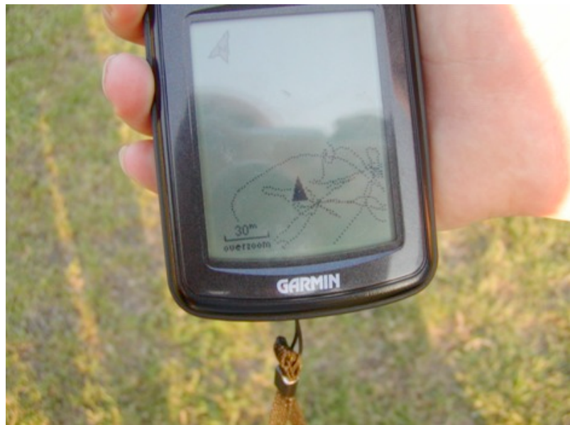
'GPS receiver used in the workshops'

Groups of young people were introduced to global positioning technology, its civic applications, and its creative potential. Guided by an artist and an animator/programmer the young people used GPS receivers to trace their walking routes around their estate, and create data patterns and signatures across Battersea Park.