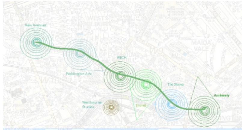
'Museum of Now map showing broadcast points on Harrow Road'